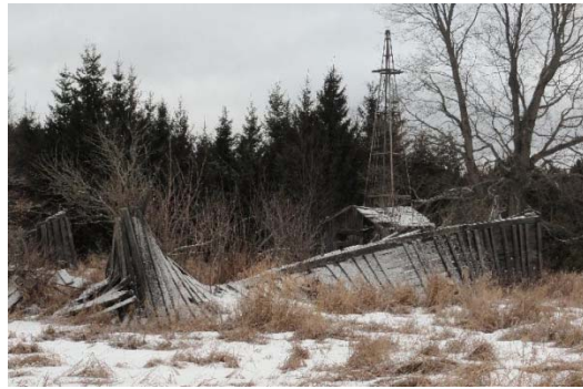
Remnants of sawmill lumberjack camp.